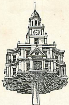
MARTIN HOUSE No. 3.